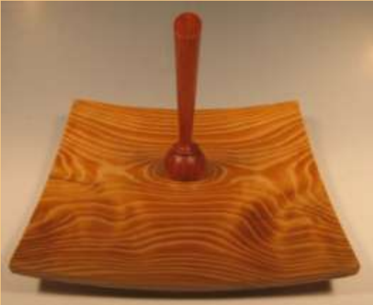
Jim Brewton - Pine & Mesquite Arm - R - Seal