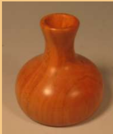
Bonnie - Cherry