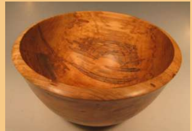
Marcia Roof - Maple Oil