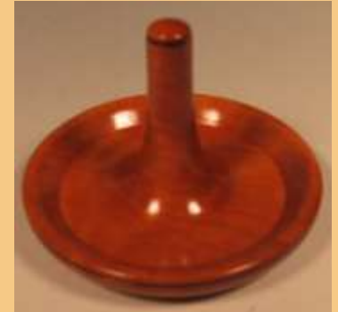
Dick Eichler - Cherry Tung / Lacquer