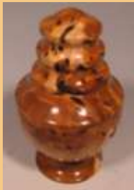
Ken Gates - Persimmon Burl Wax