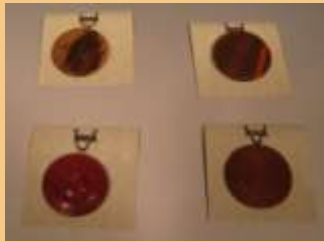
Chuck Klemme - Various Woods Wipe-On Poly Gel