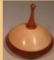
Ray Binicker - Cherry / Maple Buffed Poly