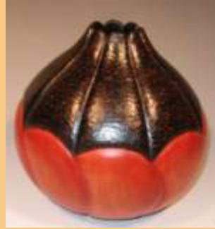
Hal Taylor -Bradford Pear w/ Lacquer Finish Pyrography & Airbrush