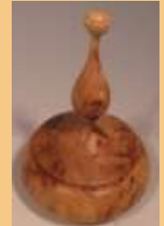
Tom Simpson - Silver Maple Wax