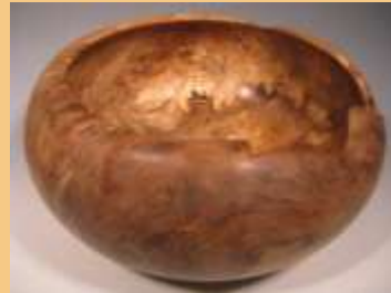
Jack Gould - Tupelo Burl Rough turned in 2007 2 coats Antique Oil w/ more to come