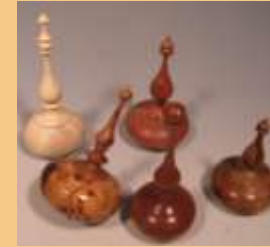
Tom Simpson - Holly / Silver Maple Wax