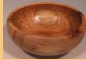
David Elwart - Hickory w/ Buffed Finish