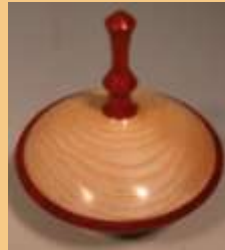
Ray Binicker - Padauk / Maple Buffed Poly