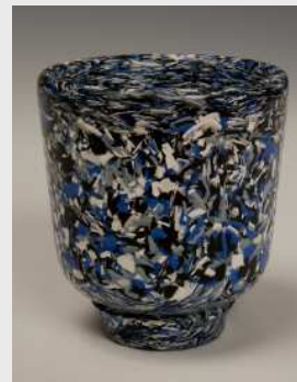
Decorative Flake Vessel

"I will then demonstrate my techniques for turning non-traditional materials such as pencils embedded in wood, cast plastics, common erasers and more. Additionally, I plan to show you how to use the Andre Martel hook tool for engrain hollowing along with a couple of tools new to my tool box that will help make your turning life a bit easier and more fun."