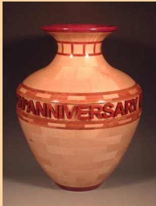
Dick Lacharite - Maple and Purpleheart Vase with Lacquer