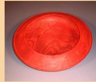
Chuck Klemme - Oak Bowl with Natural Finish