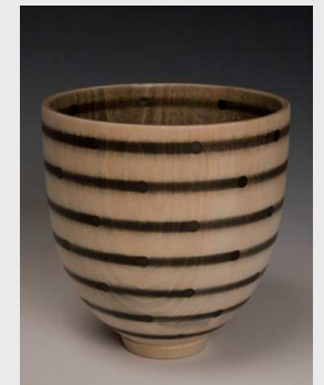
Black Woodless Pencil