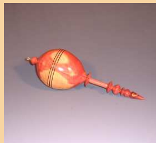
Ken Cutler - Red Cedar Ornament with Clear Coat