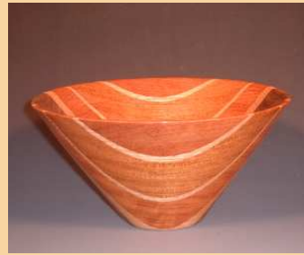
Chuck Klemme - Walnut, Ash and Mahogany with EEE