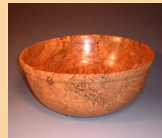
Bill Easterling - Spalted Elm Salad Bowl with Friction Polish on outside