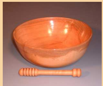
Wanda Easterling - Pecan Bowl and Honey Dipper / Friction Polish