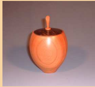
Gerald Starnes - Cherry and Ebony Box with Oil Finish