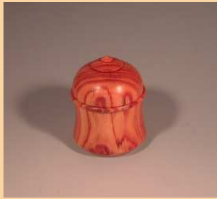
Gerald Starnes - Tulipwood Lidded Box with Oil Finish