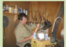
Now that's a bowl gouge!