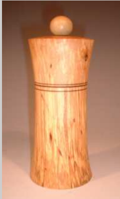
Roland Besel - Spalted Birch and Holly Finial