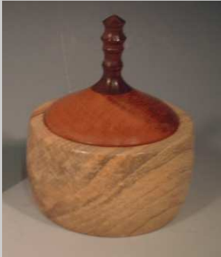
Nathaniel Binnicker - Spalted Sycamore, Tiger Wood and Walnut