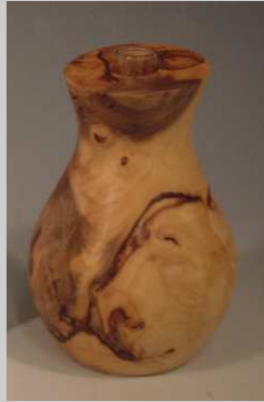
Roland Besel - Crepe Myrtle Weed Pot