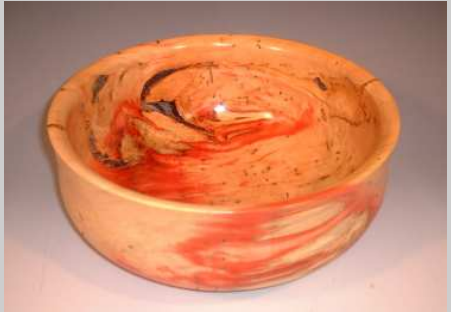
Dick Fuller - Box Elder