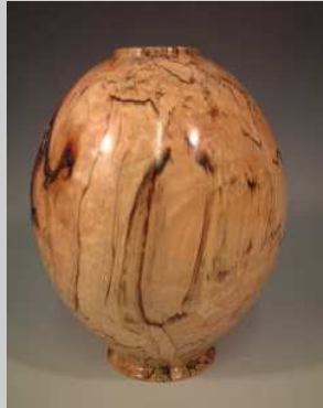
Dick Fuller - Spalted Maple