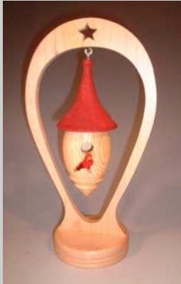
Dick Fuller - Ash and Wood Dye