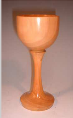
Roland Besel - Pear