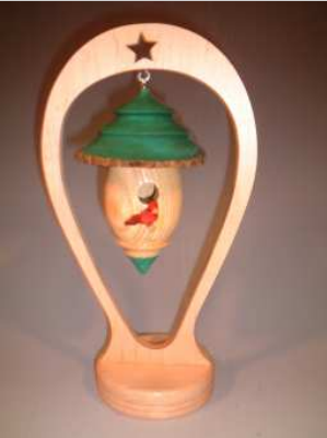
Dick Fuller - Ash and Wood Dye