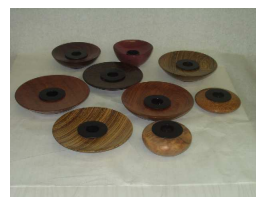
Tom Harvard Assorted Woods Various Finishes