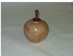
Gerald Starnes Maple/Cocobolo EEE System