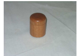
Jack Gould Cherry Antique Oil/Briwax