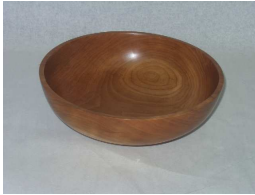
John Barnes Cherry Tung Oil/Briwax