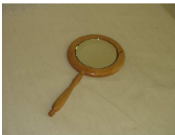
Jack Gould Maple Antique Oil/Briwax