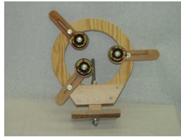
Jack Gould Steady Rest