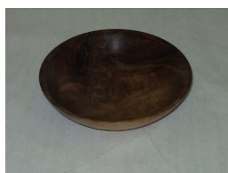
Joy Lenhoff Walnut Briwax