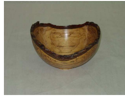
Charles Watson Spalted Maple Urethane Oil