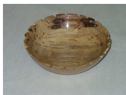
Dick Lenhoff Oak Briwax