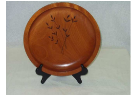
Charles Watson Mahogany Urethane Oil