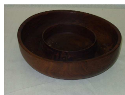
Erskine Moore Walnut Oil