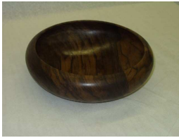
Gerald Starnes Black Limba Watco Golden Oak