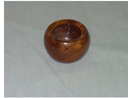
Jack Gould Bradford Pear Minwax Antique Oil