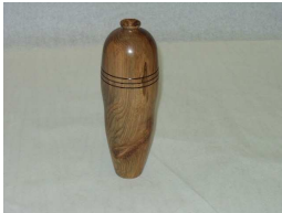
Jack Gould Maple Minwax Antique Oil