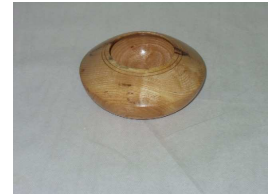
Jack Gould Ash Minwax Antique Oil