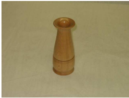
Sam Brasher Maple Spray Lacquer